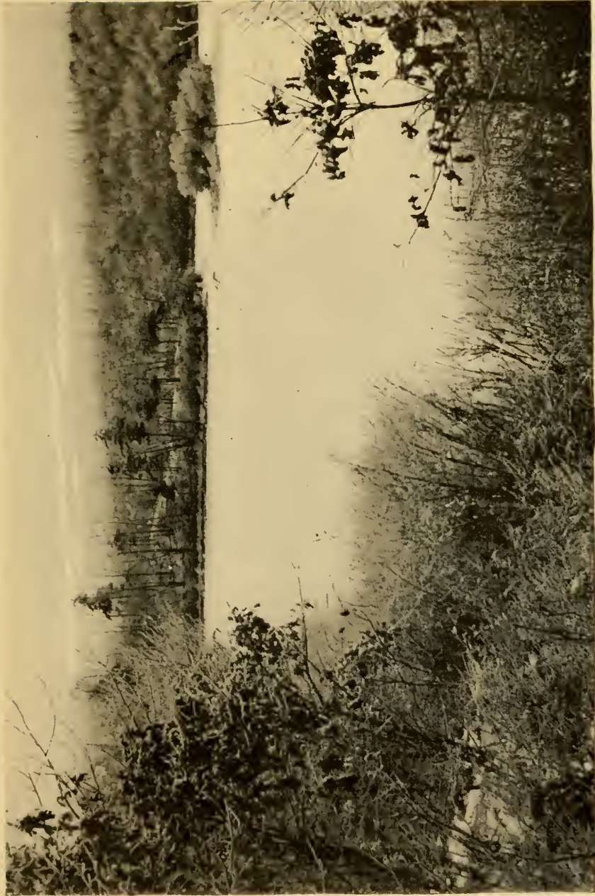
Goose Pond in winter