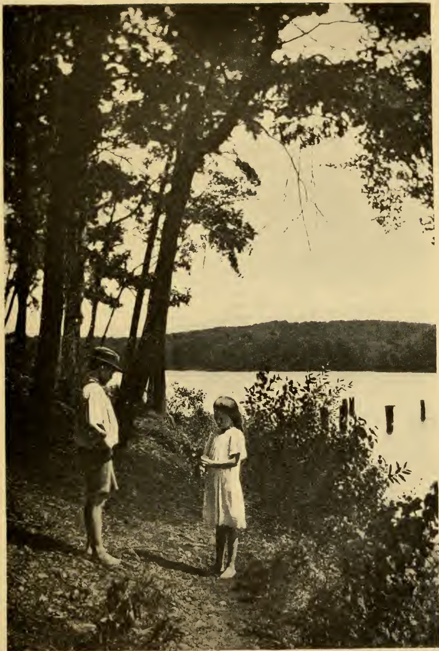
Children in the woods by the pond