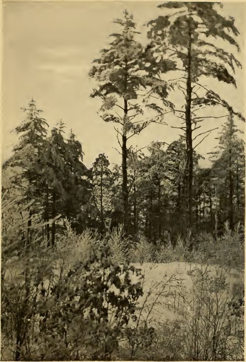
The icy trees