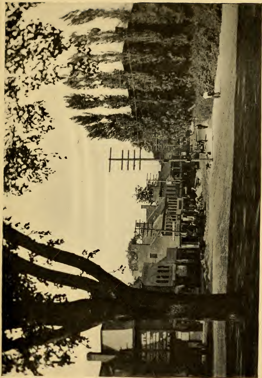
Concord — The business centre