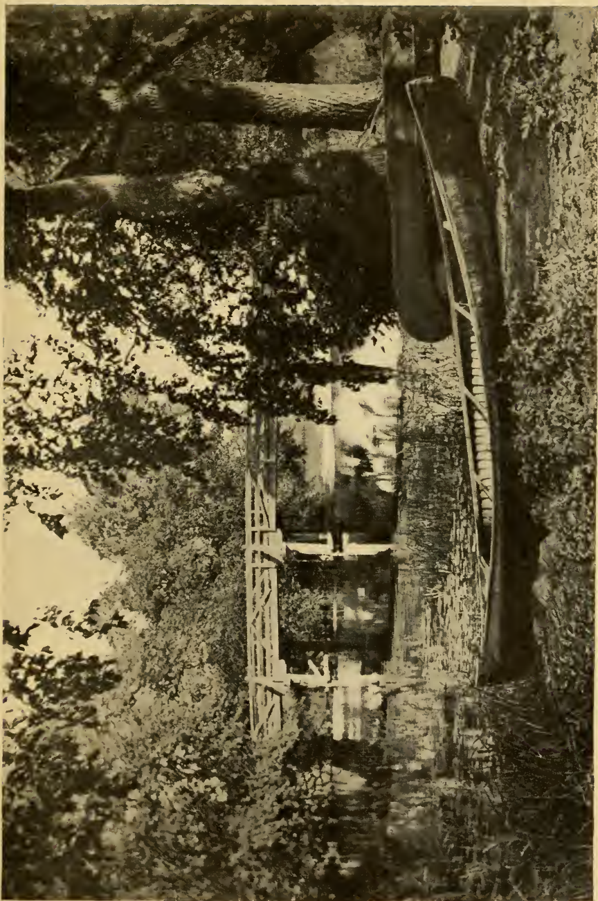
Concord battle ground