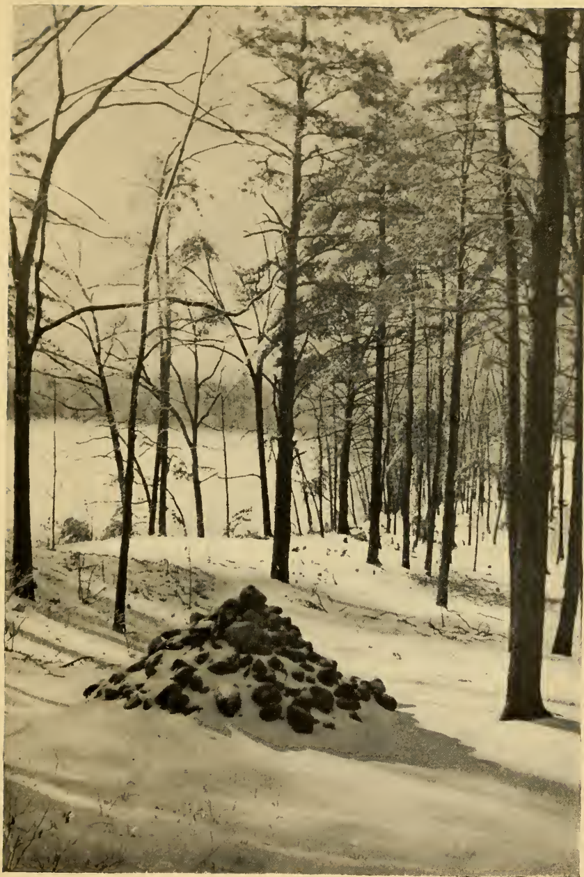
The site of Thoreau's house in March