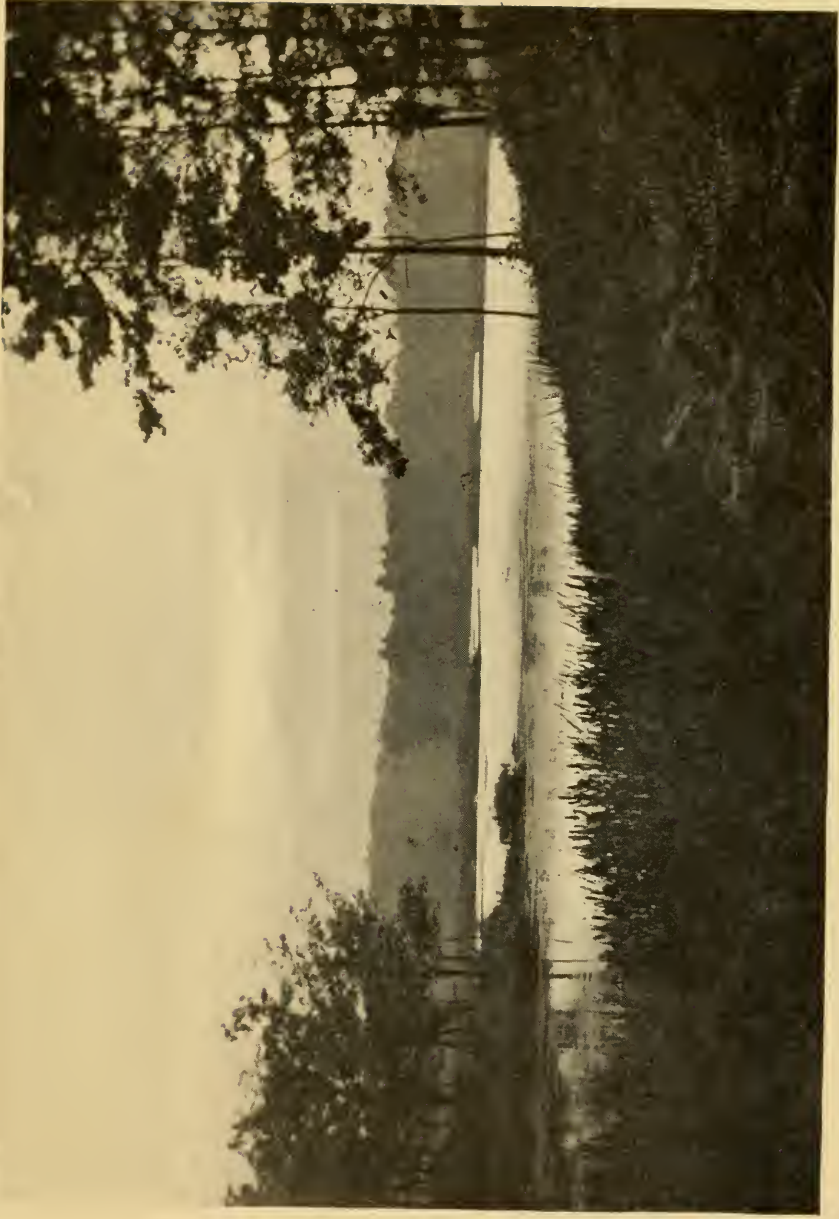
The swampy lowland