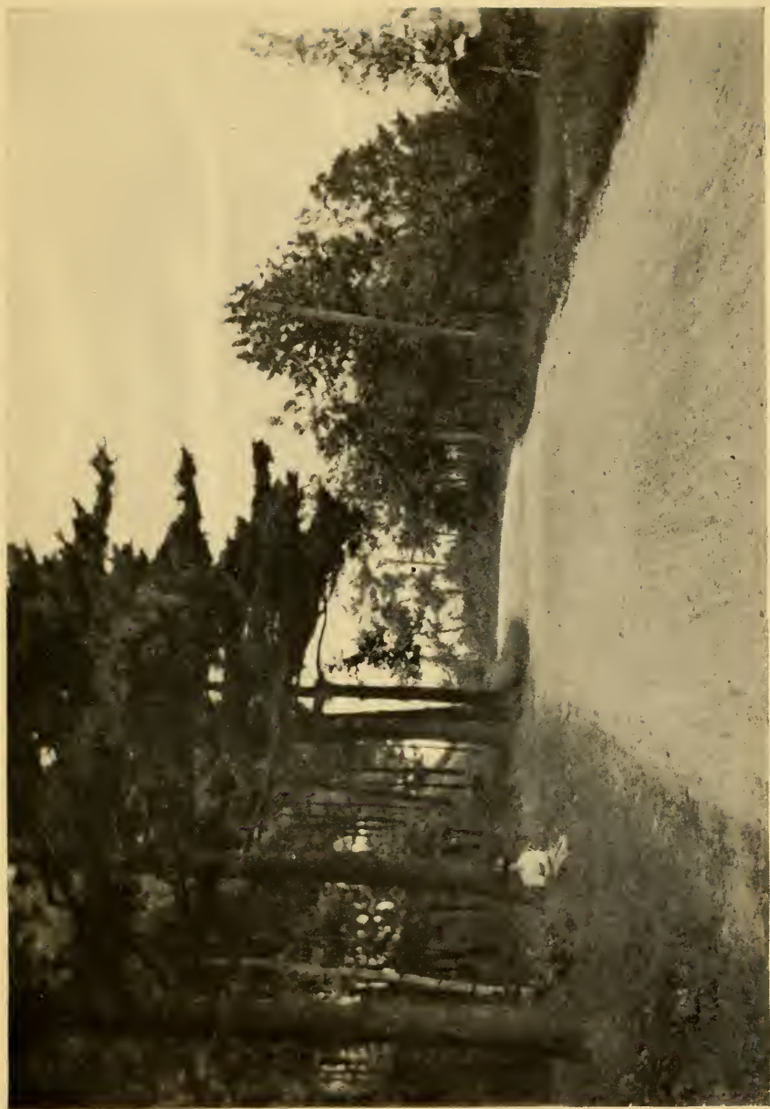
Brister's Hill and the Walden highway