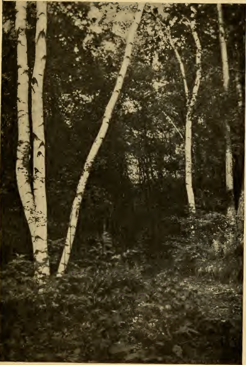
In the woods near Fair-Haven Hill