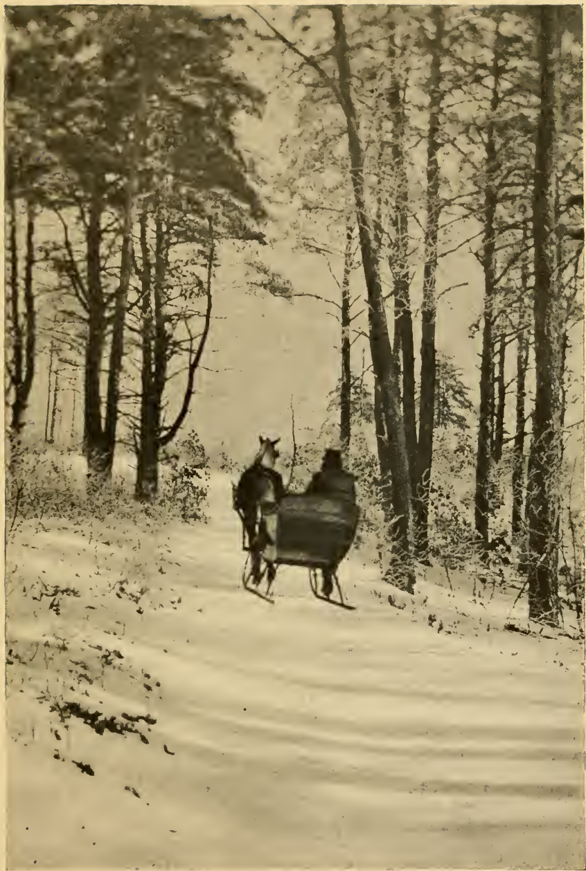
A winter road near Thoreau's cabin