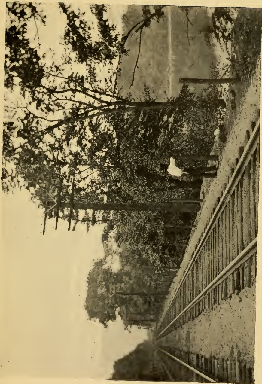
The railroad at the east end of the pond