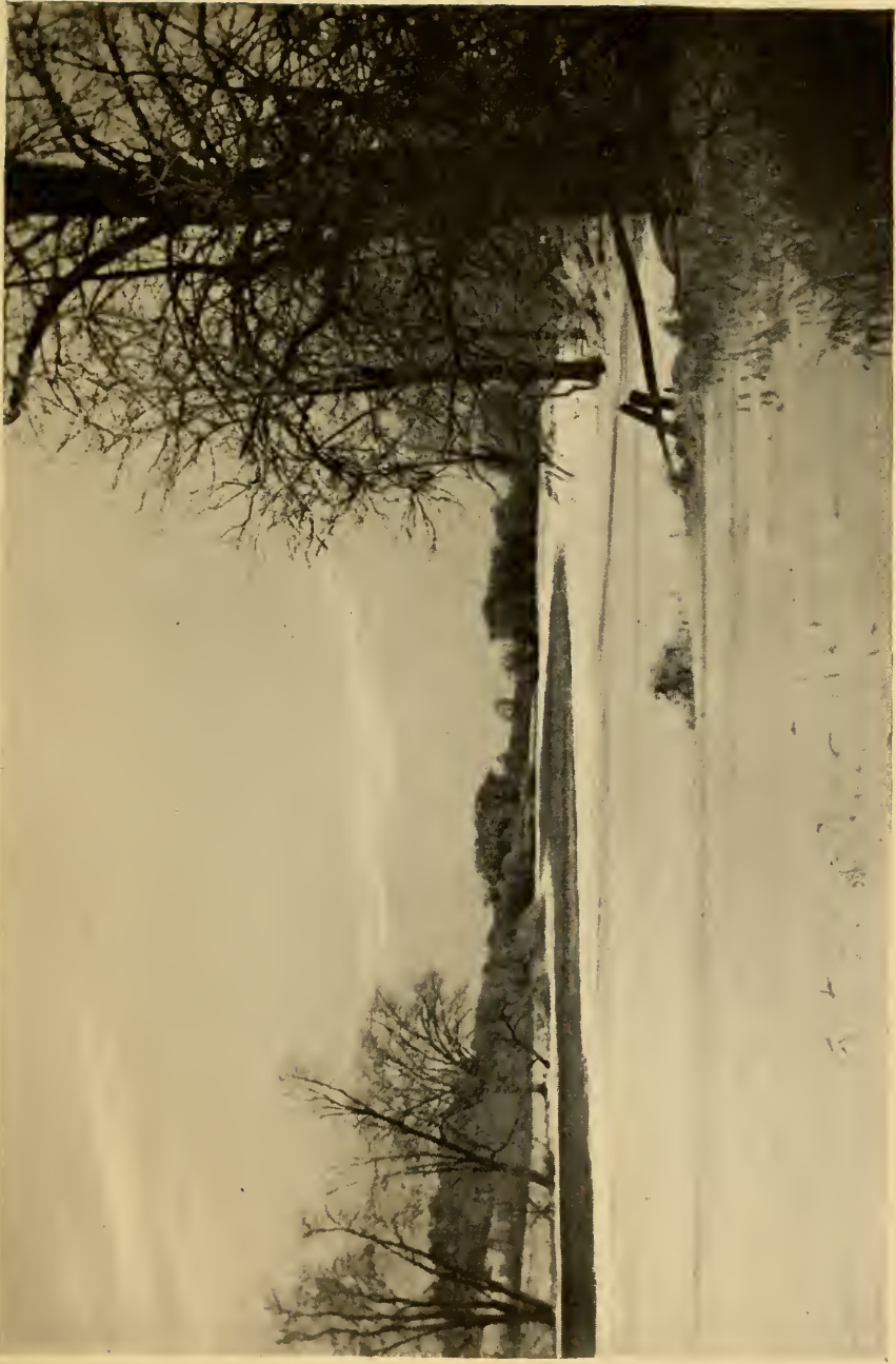
The Concord River in winter