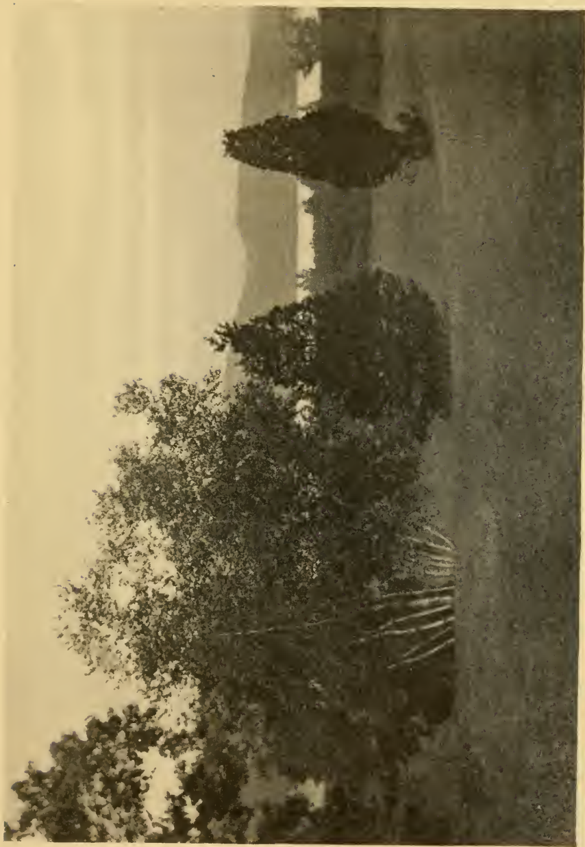
The Baker Farm