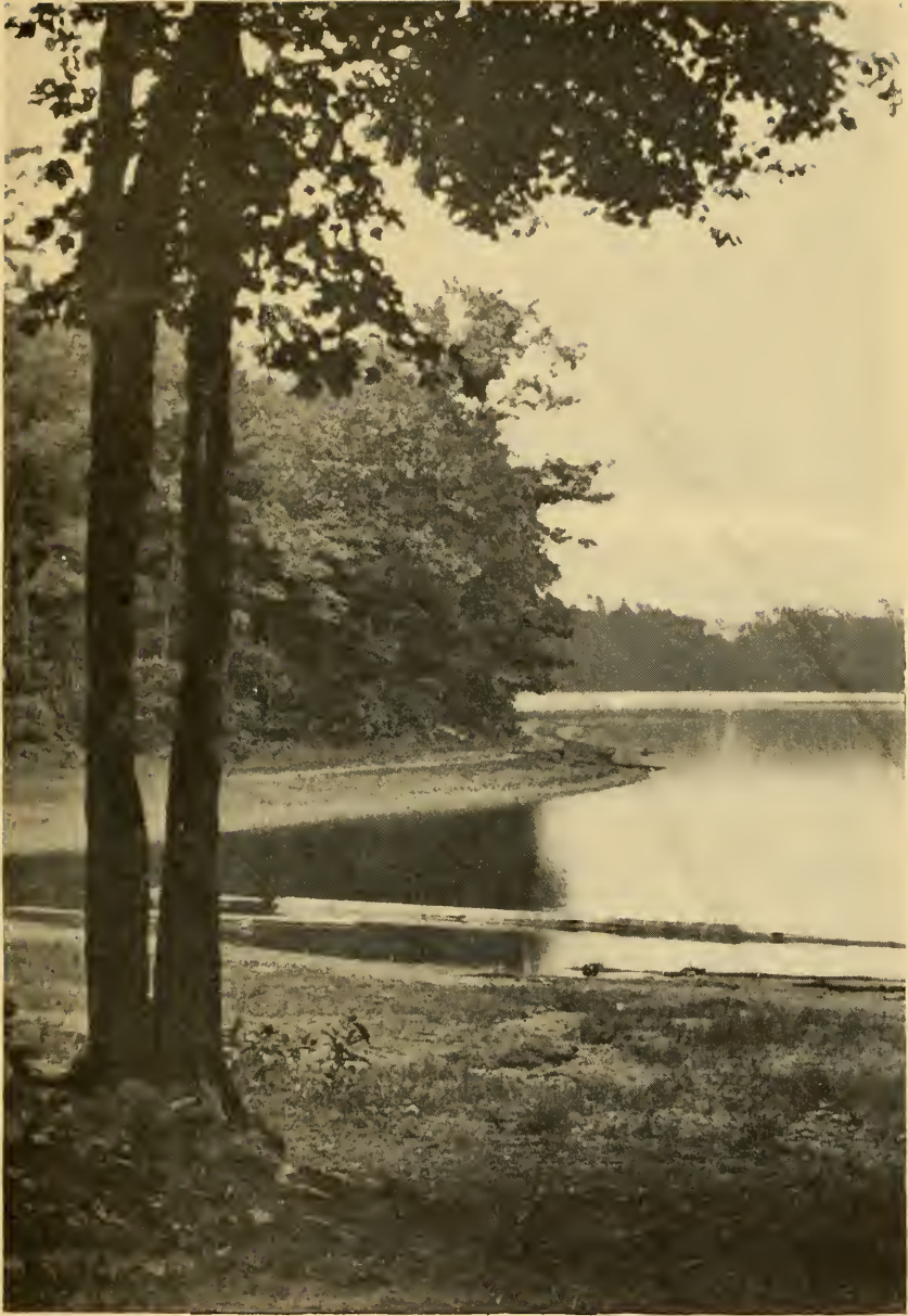
Thoreau's Cove, just below his dwelling