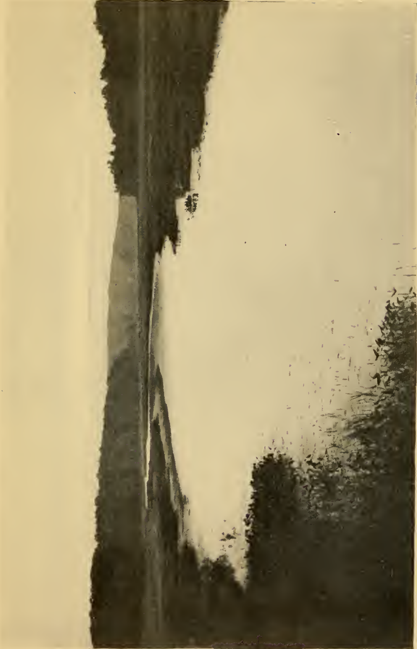
The river near Nine Acre Corner