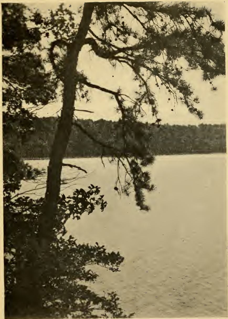
One of the pitch pines by the shore of Walden