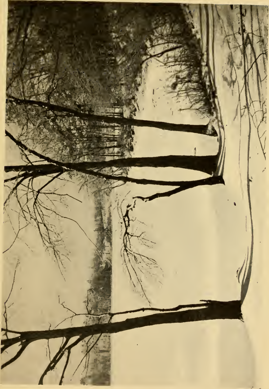
The icebound pond