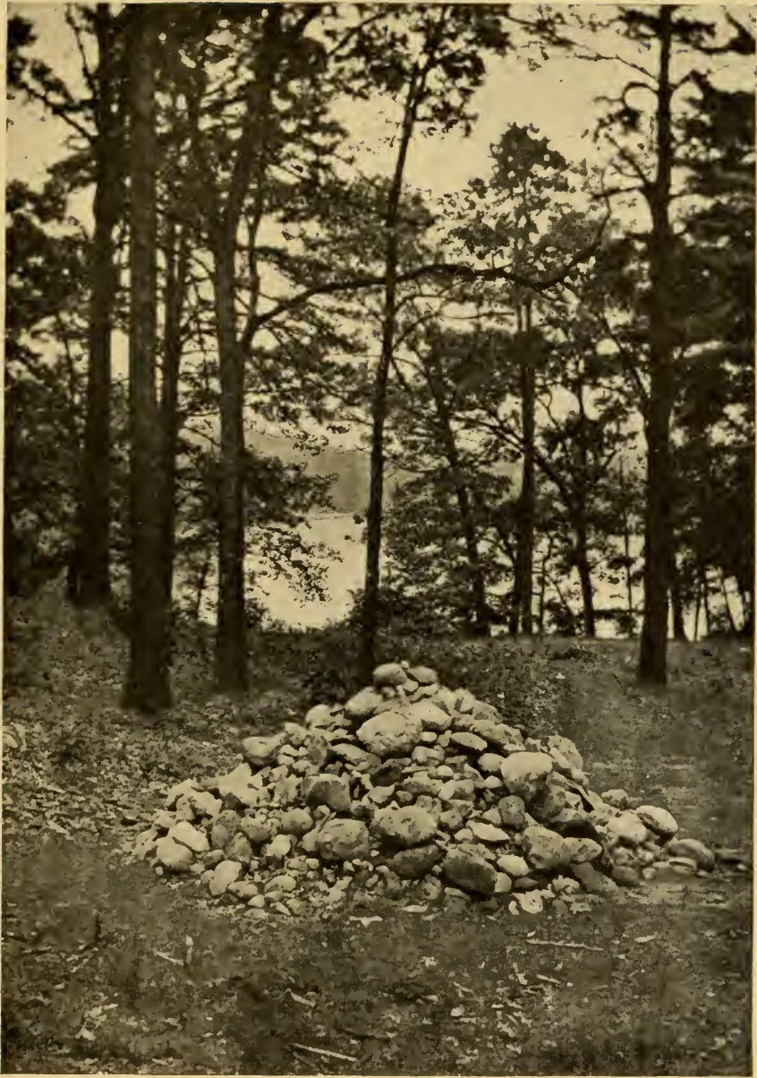
Where Thoreau's cabin stood