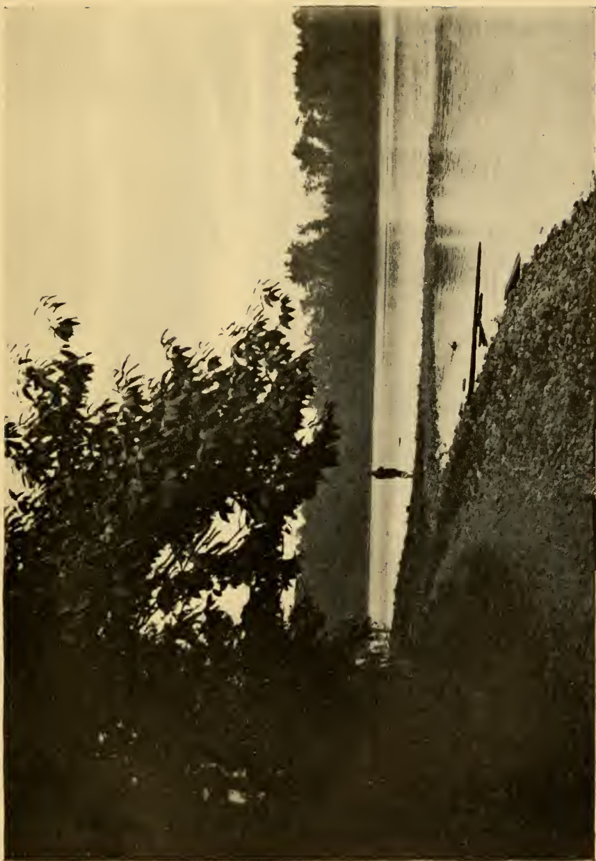
The stony shore