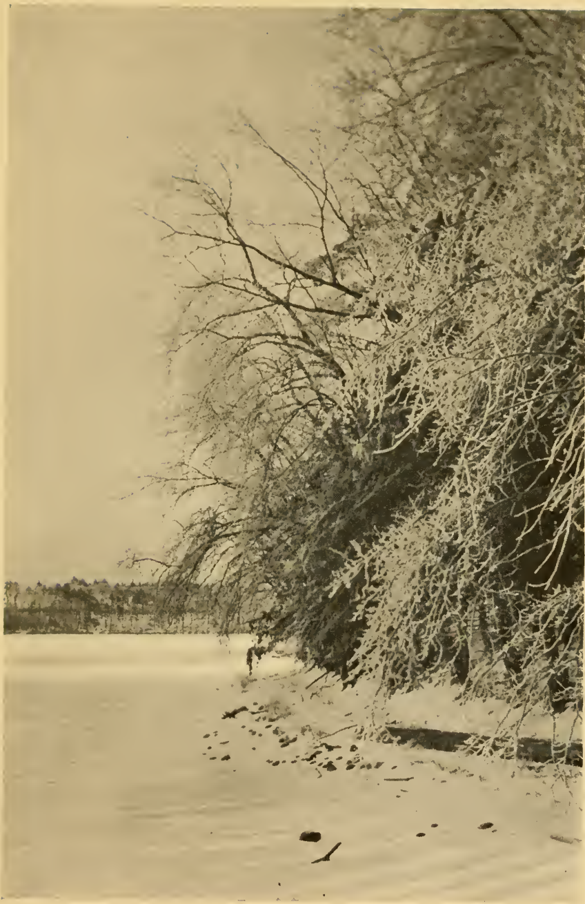
Walden Pond on a winter morning