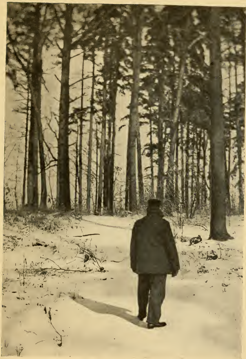
Among the pines bordering the pond