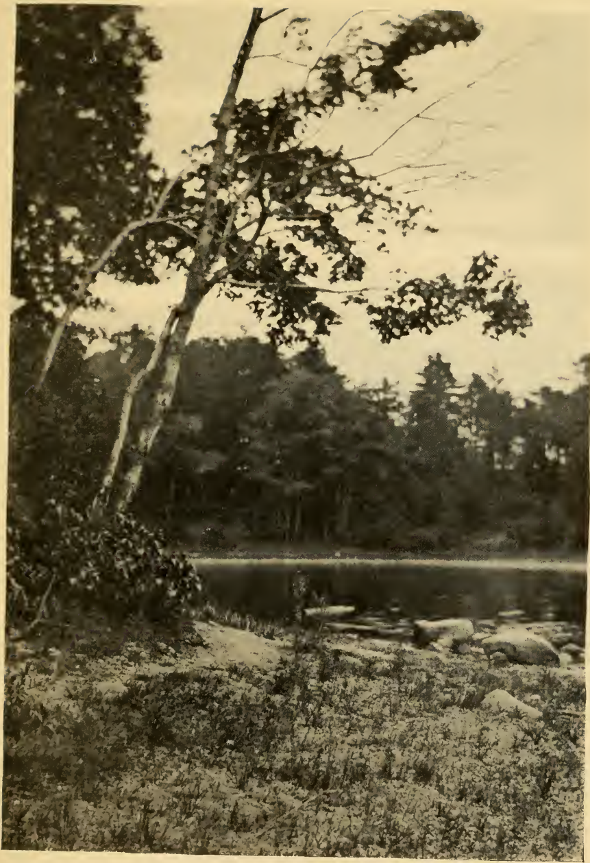
A glimpse of Walden