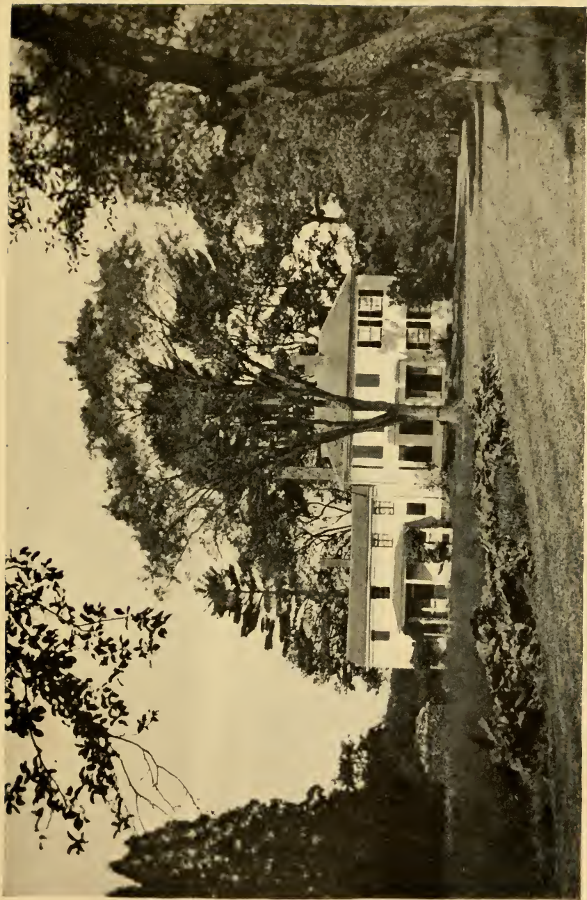
Emerson's home, where Thoreau was a frequent visitor