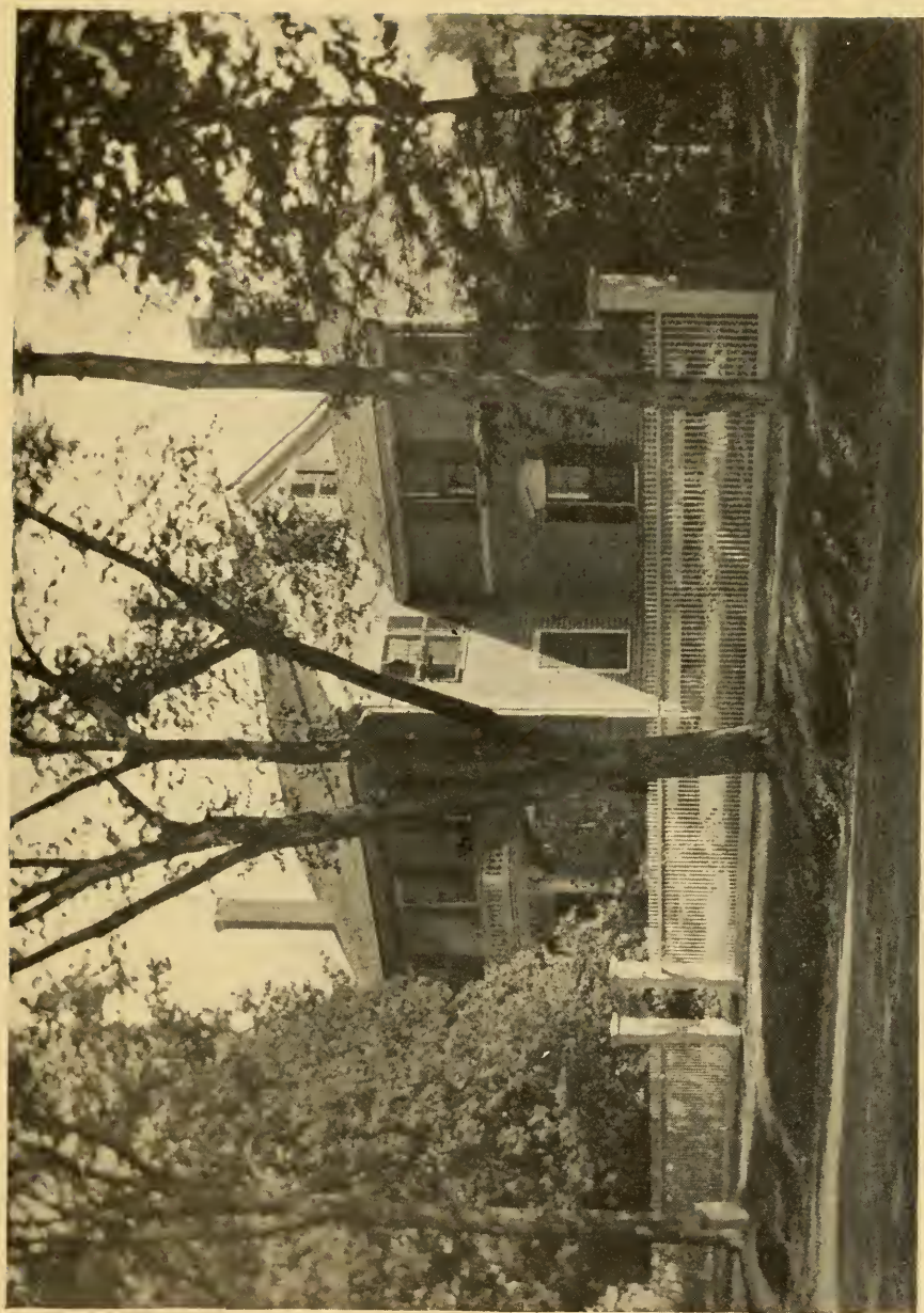
The Concord house in which Thoreau died